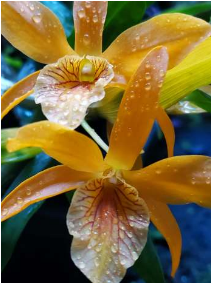
Dendrobium Starburst Fire wings., Whitney Steele