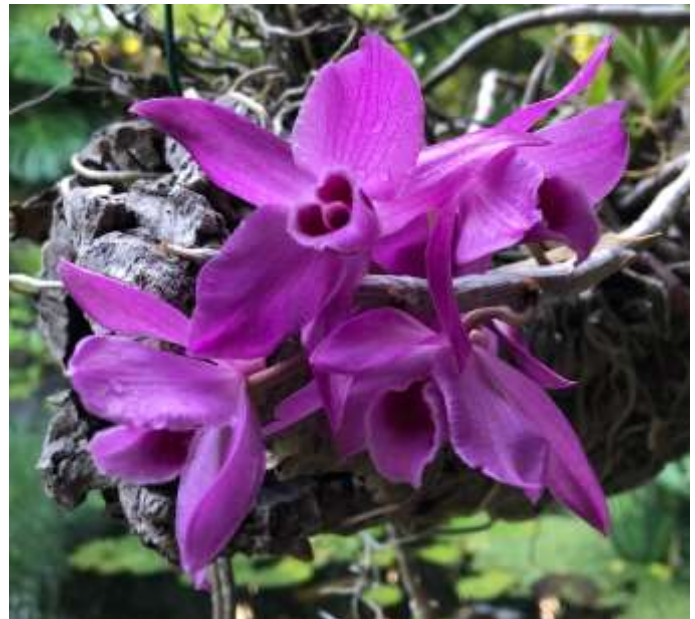
Geri's Hono Hono Orchid, April 2022