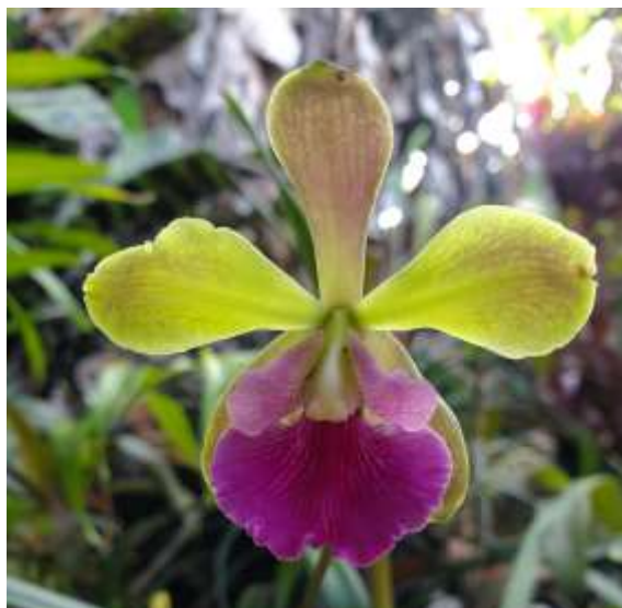
Whitney Steele, Epc. serena's Tinkerbell x (E. Nursery Rhyme x randii) First time bloom from our keiki potting meeting in 2019