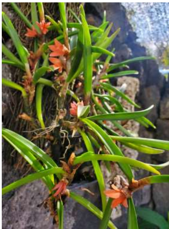
Ceratostylis rubra