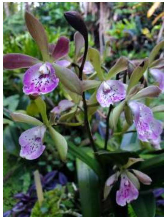
No name, Whitney Steele