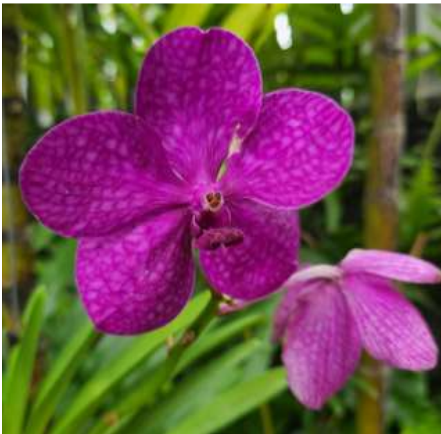
Vanda hybrid