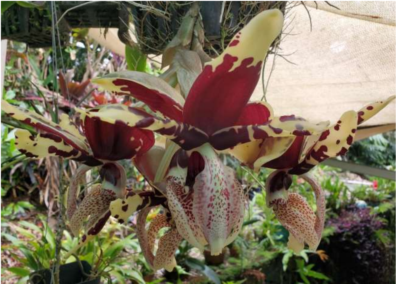
Stanhopea nigroviolacea